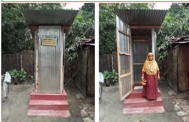
A view of Sanitary Toilet used by beneficiary Sanitation Program- 2019 Implemented by: BSDS, R.K Road, Post Box No-15, Kurigram-5600 Sadar Upazila, Kurigram Disrict, Bangladesh, Funded by- Bangladesh NGO Foundation (BNF), Mahakhali Dhaka.