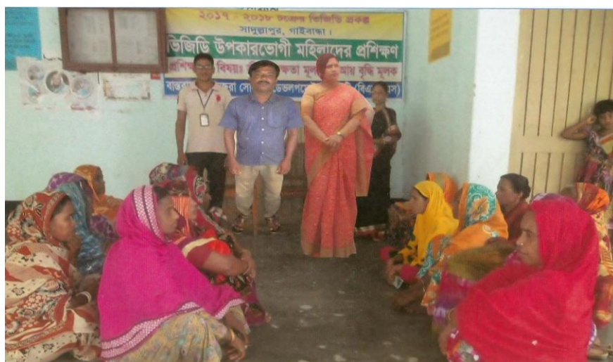
A view of VGD Training Program examined by the Upazila Mohila Bishok Kormokorta, Sadullapur Upazila, Gaibandha District, Bangladesh.