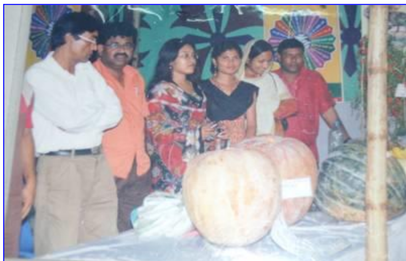
A view of Agriculture Fair-2008 under Grater Rangpur Agriculture & Rural Development Project, DAE, Kurigram District, Supported by IDB & GOB