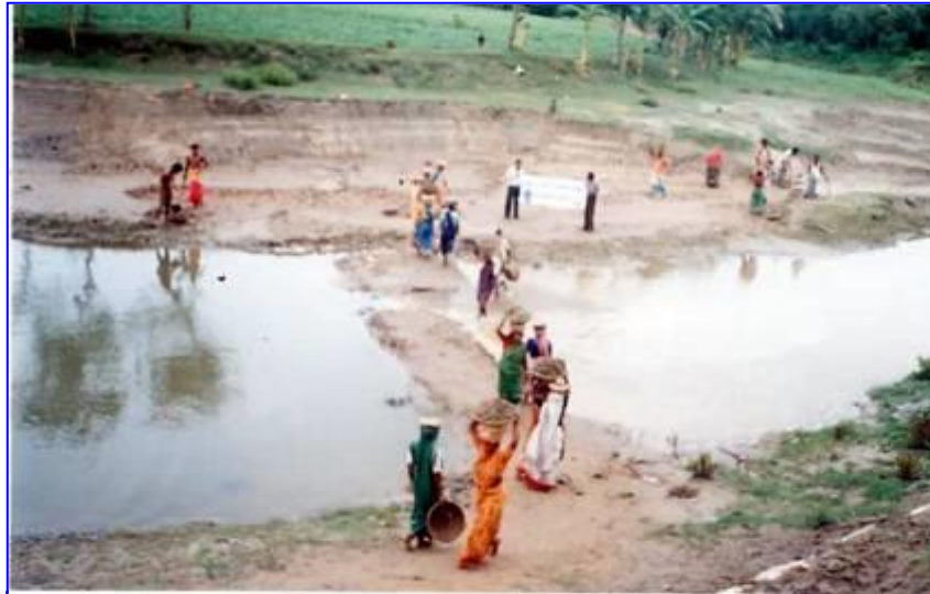
A view of working women at Belgacha Hafija Madrasa field protection, Belgacha Union, Sadar, Kurigram. The Cash For Work Programme-May-June'2005 Supported by UNDP Bangladesh.