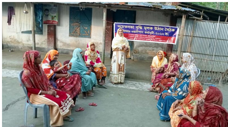
A view of Uthan Boithok Sanatition Program- 2019 Implemented by: BSDS, R.K Road, Post Box No-15, Kurigram-5600 Sadar Upazila, Kurigram Disrict, Bangladesh, Funded by- Bangladesh NGO Foundation (BNF), Mahakhali Dhaka.