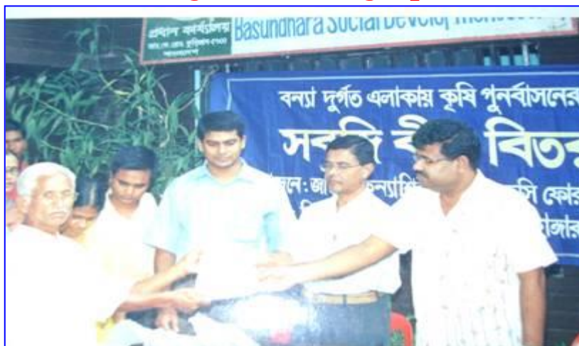
A view of Seed Distribution at Sadar Upazila, Kurigram District of Seed Distribution Programme'2007 Supported by Hanger Project, Bangladesh.