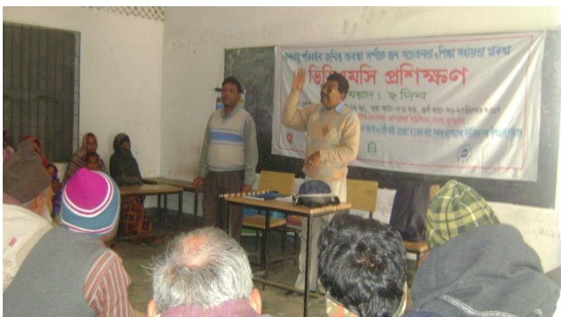
A view of Training session demonstrated by Executive Director, BSDS for VDMC Member on Climate Change Resilience Project at Sdar upozi/la, Kurigram District, Bangladesh.