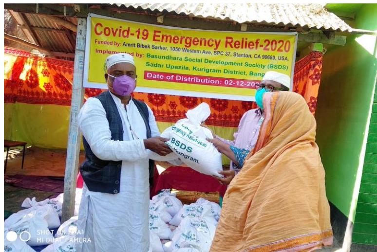
A view of Covid-19 Emergency Relief-2020 Program Implemented by: BSDS, R.K Road, Post Box No-15, Kurigram-5600 Sadar Upazila, Kurigram District, Bangladesh, Funded by- Amrit Bibek Sarker,1050 Western Ave, SPC 37, Stanton CA 90680, USA.