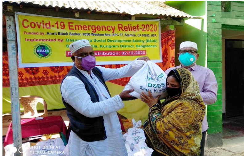
A view of Covid-19 Emergency Relief-2020 Program Implemented by: BSDS, R.K Road, Post Box No-15, Kurigram-5600 Sadar Upazila, Kurigram District, Bangladesh, Funded by- Amrit Bibek Sarker, 1050 Western Ave, SPC 37, Stanton CA 90680, USA.