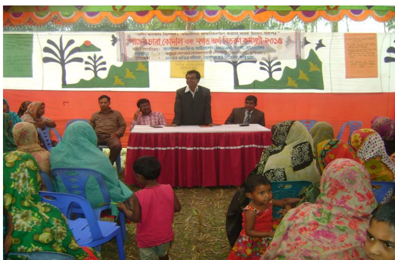
A view of IGA Training Session Presented by Upazila Social Welfare Officer, Shahar Welfare Officer & ED, BSDS Under Tree Plan Distribution Program-2015 Implemented by: BSDS, R.K Road, Post Box No-15, Kurigram-5600 Sadar Upazila, Kurigram District, Bangladesh, Funded by- Bangladesh NGO Foundation (BNF), Mahakhali Dhaka.