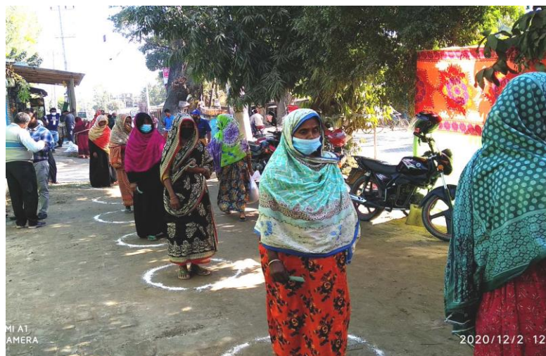
A view of Covid-19 Emergency Relief-2020 Program Implemented by: BSDS, R.K Road, Post Box No-15, Kurigram-5600 Sadar Upazila, Kurigram District, Bangladesh, Funded by- Amrit Bibek Sarker, 1050 Western Ave, SPC 37, Stanton CA 90680, USA.