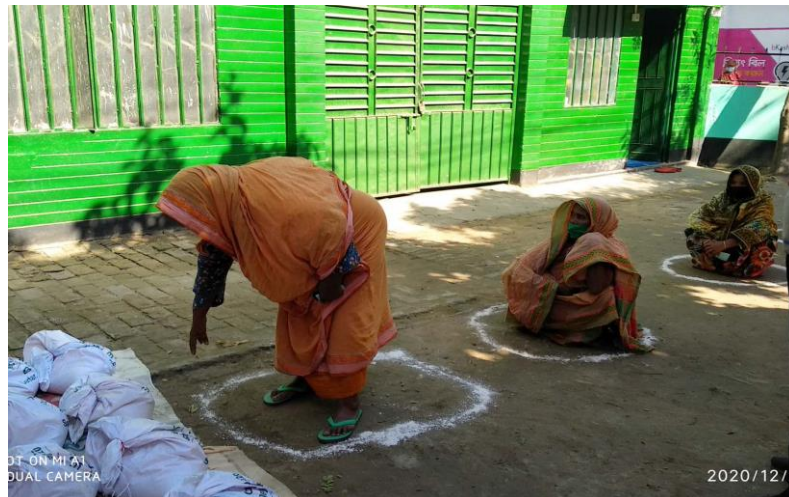
A view of Covid-19 Emergency Relief-2020 Program Implemented by: BSDS, R.K Road, Post Box No-15, Kurigram-5600 Sadar Upazila, Kurigram District, Bangladesh, Funded by- Amrit Bibek Sarker,1050 Western Ave, SPC 37, Stanton CA 90680, USA.