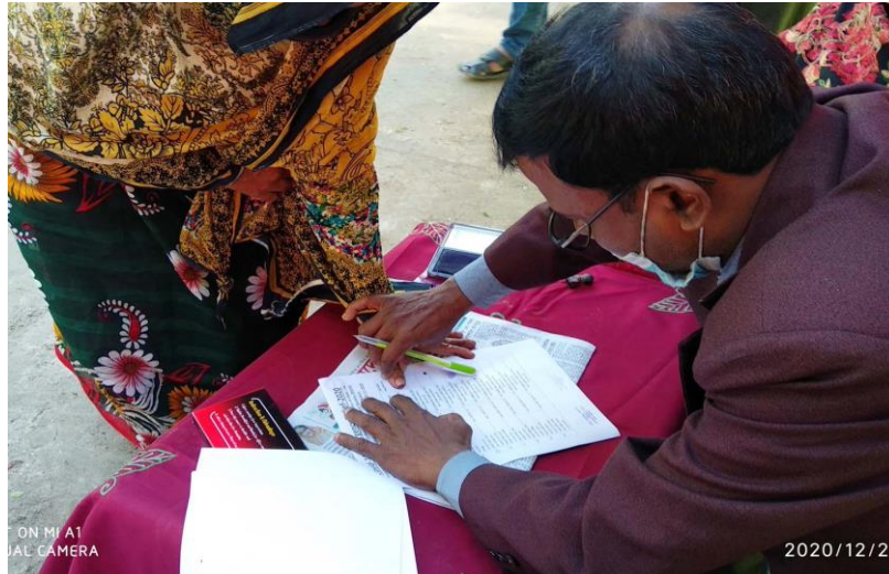
A view of Covid-19 Emergency Relief-2020 Program Implemented by: BSDS, R.K Road, Post Box No-15, Kurigram-5600 Sadar Upazila, Kurigram District, Bangladesh, Funded by- Amrit Bibek Sarker,1050 Western Ave, SPC 37, Stanton CA 90680, USA.