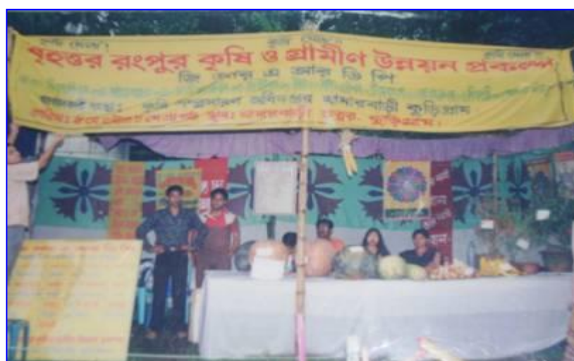
A view of Agriculture Fair-2008 under Grater Rangpur Agriculture & Rural Development Project, DAE, Kurigram District, Supported by IDB & GOB