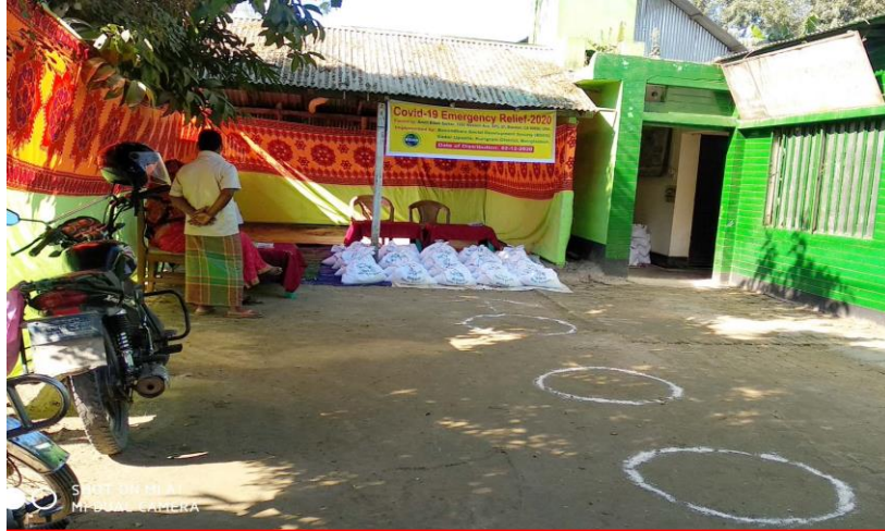
A view of Covid-19 Emergency Relief-2020 Program Implemented by: BSDS, R.K Road, Post Box No-15, Kurigram-5600 Sadar Upazila, Kurigram District, Bangladesh, Funded by- Amrit Bibek Sarker, 1050 Western Ave, SPC 37, Stanton CA 90680, USA.