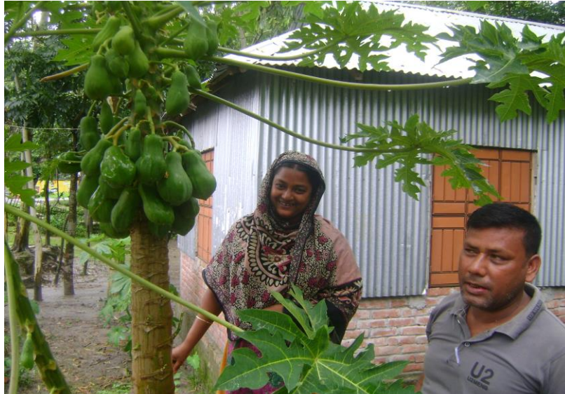
A view of Grater Rangpur Agriculture & Rural Development Project, DAE, Kurigram District, Supported by IDB & GOB