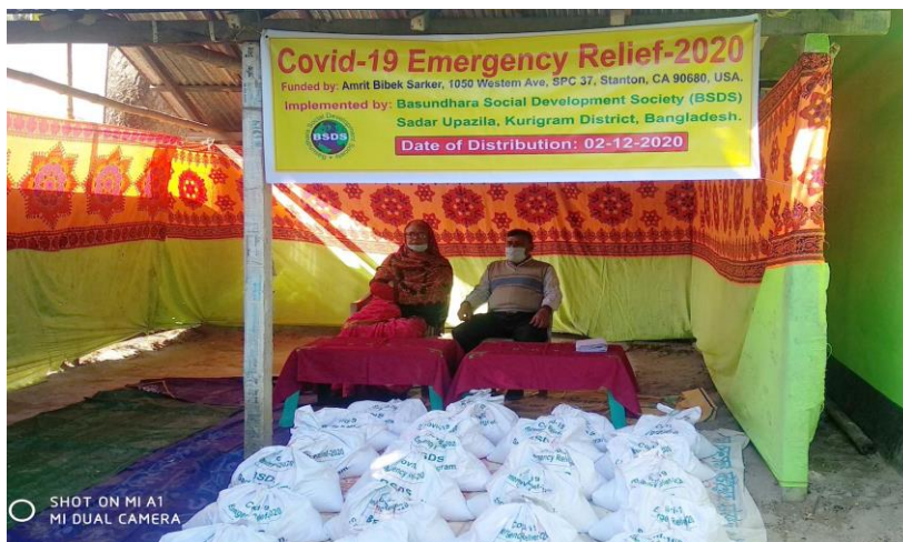
A view of Covid-19 Emergency Relief-2020 Program Implemented by: BSDS, R.K Road, Post Box No-15, Kurigram-5600 Sadar Upazila, Kurigram District, Bangladesh, Funded by- Amrit Bibek Sarker, 1050 Western Ave, SPC 37, Stanton CA 90680, USA.