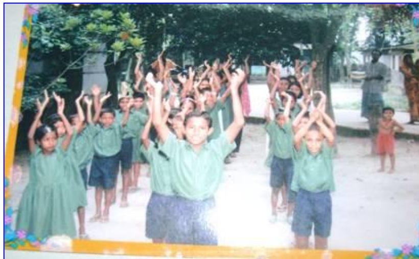
A view of PT Session on Anando Schools students of Akotapara Anando School, Sadar, Kurigram under the ROSC Project'2006 supported by World Bank, SDC & GOB.