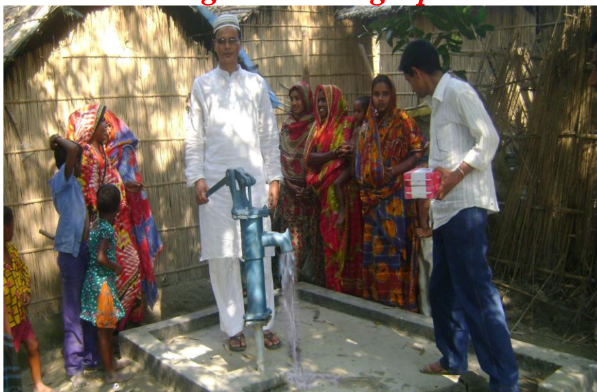
A view of Tube well installed at BCCTF project area examined by the Chairmen, Vogbanga UP ,Sadar, Kurigram District, Bangladesh.