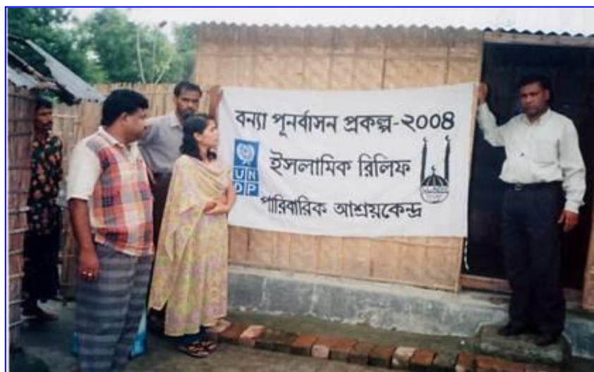
A view of Complete Shelter at Bhogdanga Union, Sadar, Kurigram of Family Shelter Support Programme, 2004, Supported by UNDP Bangladesh