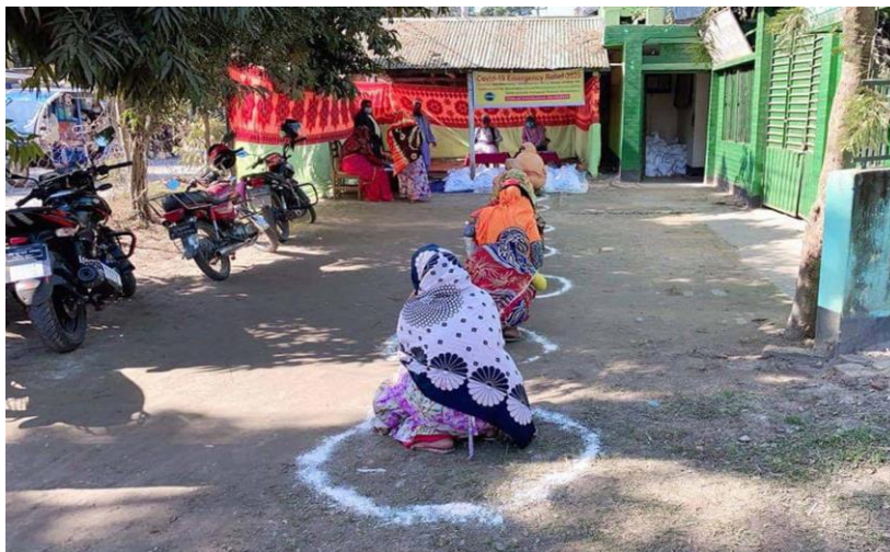
A view of Covid-19 Emergency Relief-2020 Program Implemented by: BSDS, R.K Road, Post Box No-15, Kurigram-5600 Sadar Upazila, Kurigram District, Bangladesh, Funded by- Amrit Bibek Sarker, 1050 Western Ave, SPC 37, Stanton CA 90680, USA.