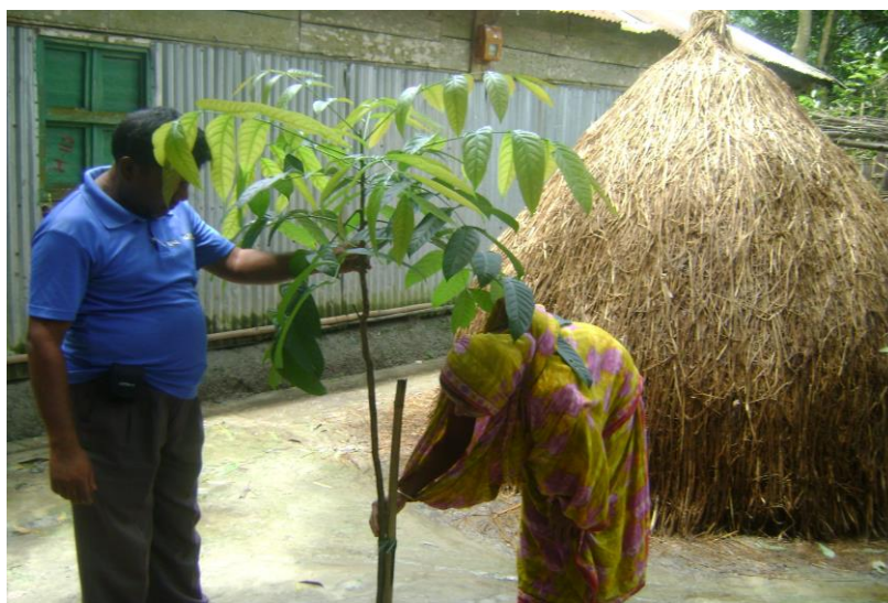
A view of Grater Rangpur Agriculture & Rural Development Project, DAE, Kurigram District, Supported by IDB & GOB