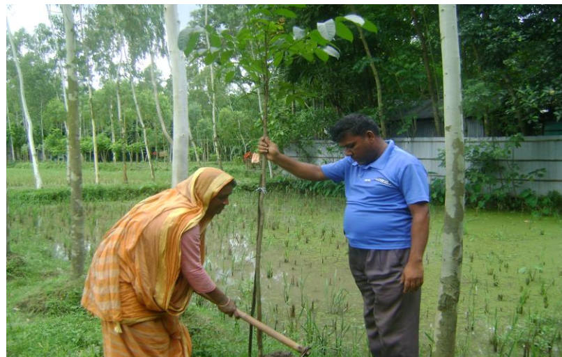
A view of Grater Rangpur Agriculture & Rural Development Project, DAE, Kurigram District, Supported by IDB & GOB