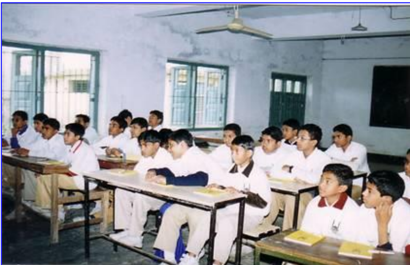
A view of Training Session on Disaster Preparedness to the students of Gov't Boys High School, Kurigram under the Disaster Preparedness Programme'2005