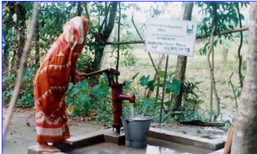
A view of Complete Tub Well at Panchgachi Union, Kurigram Sadar of WATSON Programme'2005 Supported by Islamic Relief UK Bangladesh.