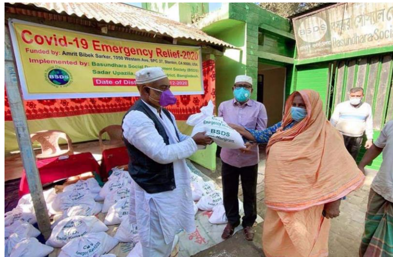
A view of Covid-19 Emergency Relief-2020 Program Implemented by: BSDS, R.K Road, Post Box No-15, Kurigram-5600 Sadar Upazila, Kurigram District, Bangladesh, Funded by- Amrit Bibek Sarker, 1050 Western Ave, SPC 37, Stanton CA 90680, USA.