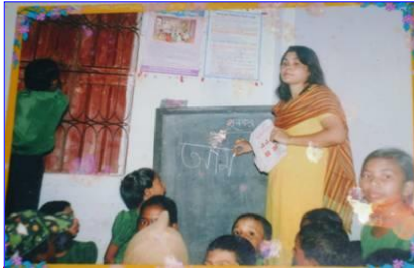
A view of Class Session on Anando Schools students of Akotapara Anando School, Sadar, Kurigram under the ROSC Project'2006 supported by World Bank, SDC & GOB.