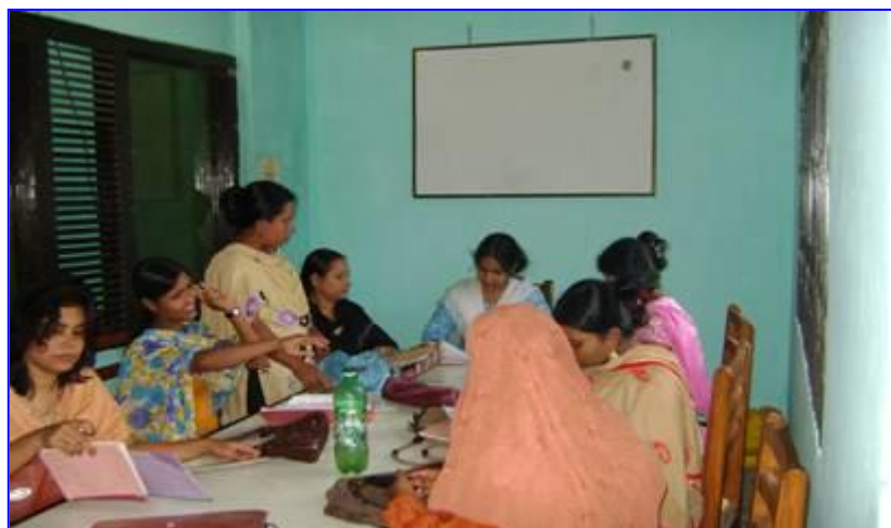
A view of Teachers Training on Meeting Minuets Writing under ROSC Project '2008 at Sadar Upazila, Kurigram District, Supported by World Bank, SDC & GOB.